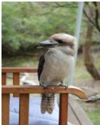
Kookaburra watching us eat lunch on our veranda at Silverleaves.

Enjoy our local wildlife and birds by not feeding them as it can have serious consequences; they could lose the ability to source food themselves, as well as cause imbalances in their nutritional requirements causing severe deficiencies.