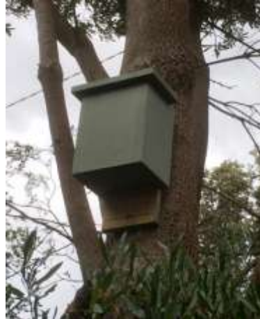
Photo: Bruce Road Micro Bat Box 2017

Victoria has 21 species of microbats (insect bats), and they are a protected species weighing up to only 150 grams and growing to 15 cm. Microbats are native to both Phillip and French Islands and are classified as a mammal – the only mammal capable of flying.