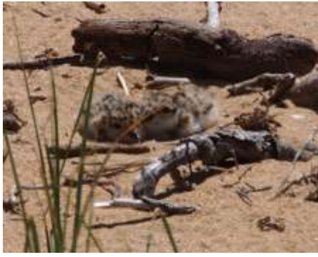
21 st January 2017

These two Hooded Plover chicks were seen a few hundred metres past the no dogs sign in the Nature Park managed area. The eggs were laid on 23 December 2016 and this photo taken a month later shows just how little protection they have, and how vulnerable they are, particularly to dogs, which is why it is so important that everyone respects the No Dogs sign at the east end of Silverleaves and keeps this area of the beach all the way to Observation Point free of dogs.